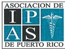
IPAs Association of Puerto Rico