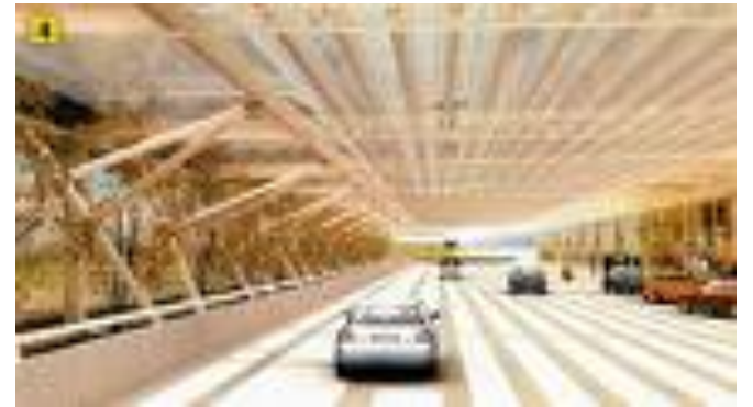
Photo: New El Dorado Airport